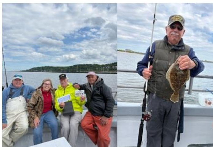
The angler with the biggest fluke received a $25 gift certificate from Fisherman's Den.