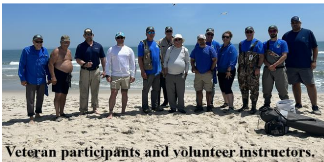
Veteran participants and volunteer instructors.

Once again, the tournament committee did a great job of making sure all guests were safe and had fun. The Governor’s Surf Fishing Tournament Committee members of the NJ Beach Buggy Association, JCAA, and NJ State Federation of Sportsmen’s Clubs work tirelessly all year to make sure the tournament is a success. View the winner list here .