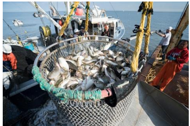
Brail Net method

That safeguard exists for a simple reason. Fish pumps allow large vessels to remove an entire school of menhaden in minutes , dramatically increasing the scale and speed of harvest. When this happens in nearshore waters, the impacts ripple throughout the ecosystem. The bait that attracts striped bass disappears. Whale and dolphin feeding activity declines. Osprey and other avian predators lose a critical food source.