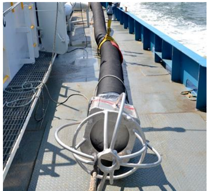
Fish pump with excluder device

In other words, the current law already provides a workable balance: efficient commercial harvesting can occur offshore, while nearshore waters remain protected from large-scale removal of baitfish.