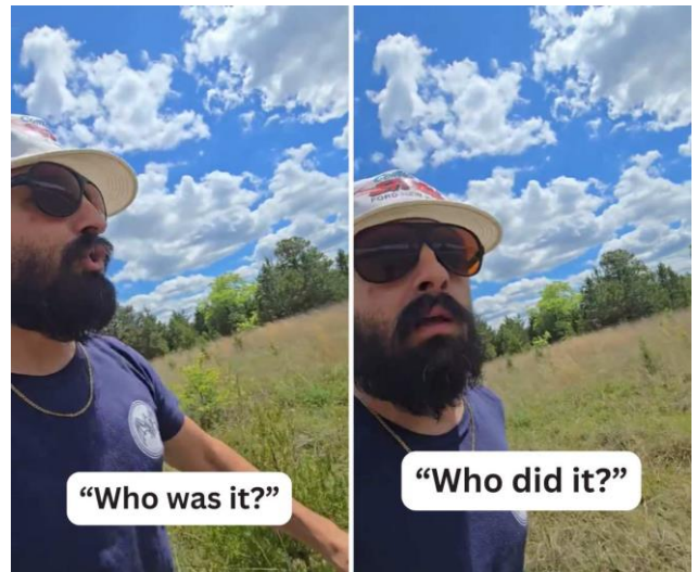
NJ farmer vents out frustration after noticing balloon litter in his farm

Balloons mean celebration. Be it a wedding ceremony, a birthday party, or a healing ritual, people hold on to these colorful, glossy balloons as long as it is necessary, and then they gently let them go. The balloons launch towards the sky , and the moment they arrive in the atmosphere, the pressure of the barreling winds causes them to burst and deflate. The resulting deflated plastic then plummets down on the ground, often falling into oceans and threatening wildlife. In a TikTok video , South Jersey farmer Timberline Farms vented out his frustration after noticing balloons repeatedly littering the grounds of his farm. "I could have accidentally eaten this," he lamented in the caption.