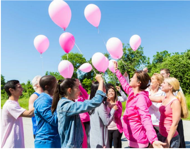
A group of people releasing pink balloons in the air

“Mad on. I swear to God, if I find out which one of you [...] is letting off balloons all helter skelter. The number of balloons that I find on this farm. Who was it? Who did it?” The bearded farmer said while walking around on a grassy patch of his farm. At one point, he focused the camera on the grass and picked up a crumpled piece of plastic , which turned out to be a deflated balloon. “This is for a 1-year-old's birthday. They ain't even gonna remember this. But I will,” he chuntered, before wrapping up the video.