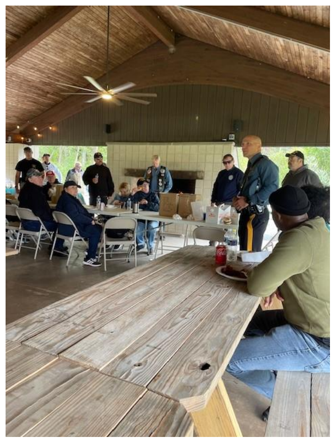
Thanks to all that attended, this was a nice event to attend before traveling to our new home.